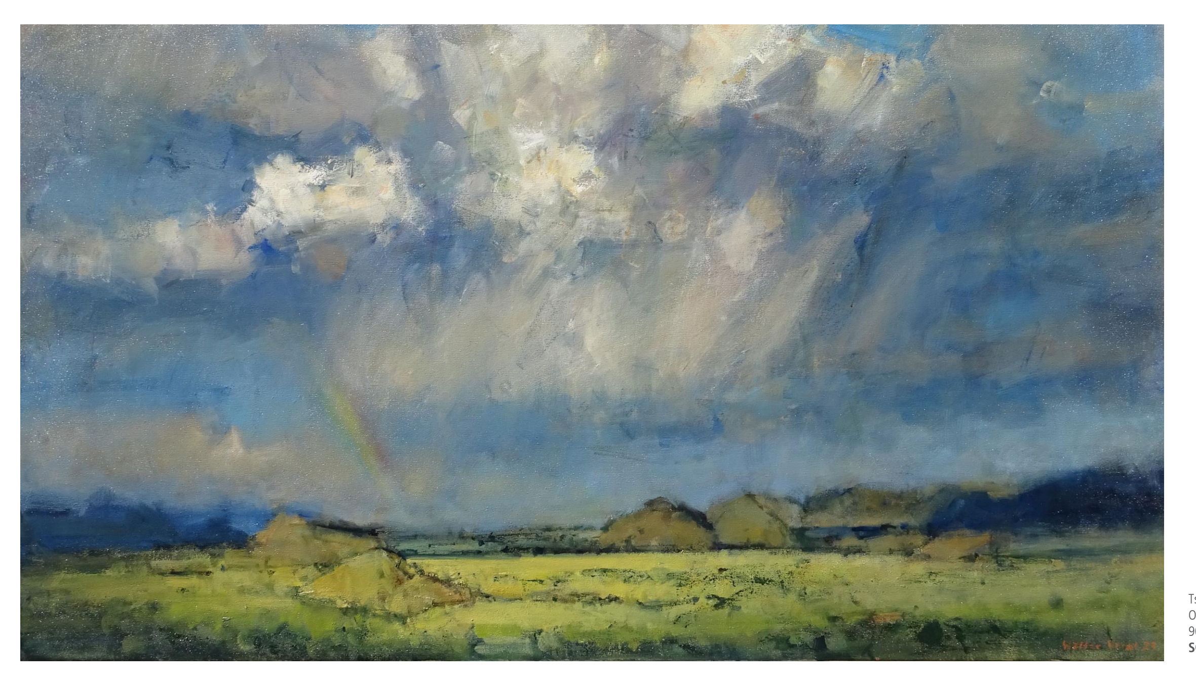
Tswalu Storm with Rainbow Oil on Canvas 90 x 160 cm SOLD